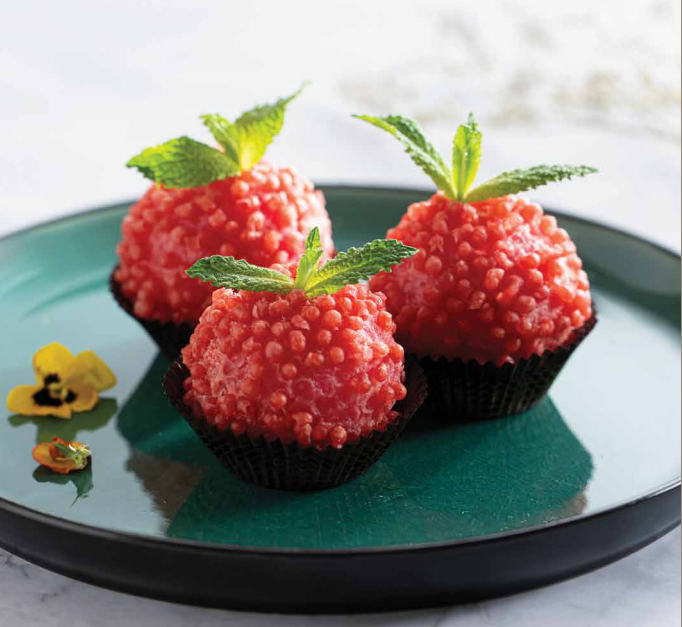
流沙荔枝球 Crispy Custard Ball