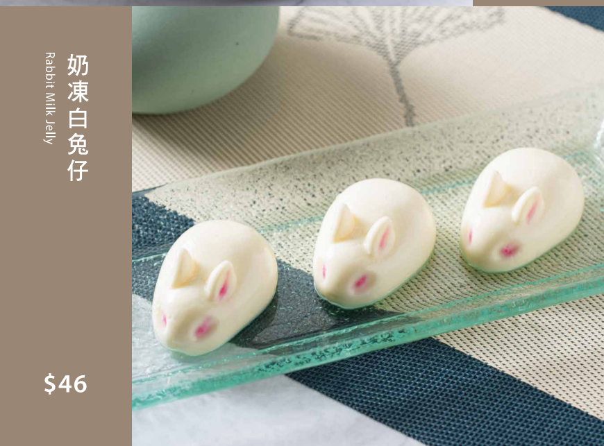
奶凍白兔仔 Rabbit Milk Jelly