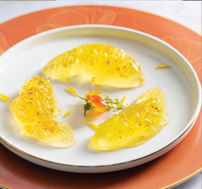
金魚桂花糕 Goldfish Osmanthus Cake